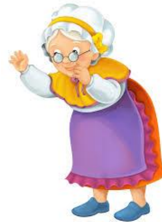
Old Mother Hubbard