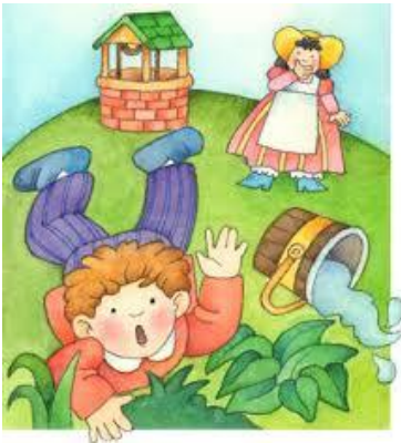
Jack and Jill

Ask the children to name and label all the nursery rhyme characters in the book. Do the children know these characters? Have they heard the original nursery rhymes? These could be explored and read further with the children.